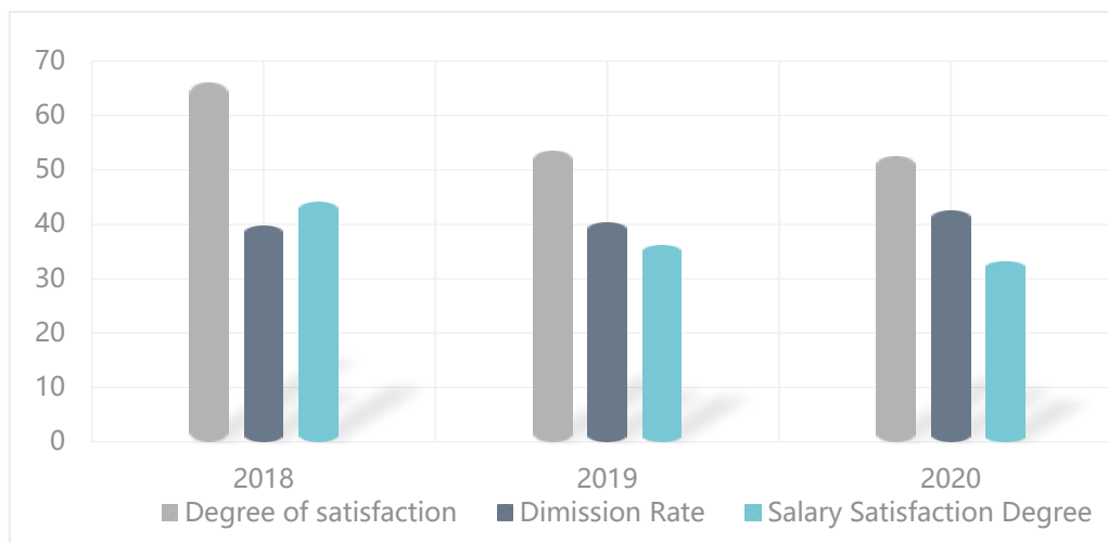
Figure 1 Employment of junior college students. (Unit/%)